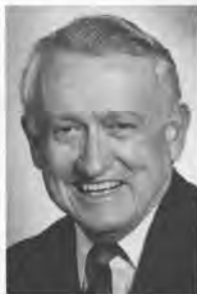
RALPH MUNRO Secretary of State

Republican. Elected as Washington's fourteenth Lieutenant Governor in 1988. He is only the second to be born in Washington, and he brings twenty-four years of public service to his position. He served in the State Legislature from 1958 to 1970 and the U.S. House of Representatives from 1972 to 1984. In Congress, he was the ranking member on the Asian and Pacific Subcommittee of the Foreign Affairs Committee, and the Merchant Marine and Fisheries Committee. He also served as a U.S. Delegate to the General Assembly of the United Nations in 1983. He resides in Seattle.