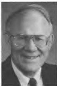
JOEL PRITCHARD Lieutenant Governor

Republican. Elected as Washington's fourteenth Lieutenant Governor in 1988. He is only the second to be born in Washington, and he brings twenty-four years of public service to his position. He served in the State Legislature from 1958 to 1970 and the U.S. House of Representatives from 1972 to 1984. In Congress, he was the ranking member on the Asian and Pacific Subcommittee of the Foreign Affairs Committee, and the Merchant Marine and Fisheries Committee. He also served as a U.S. Delegate to the General Assembly of the United Nations in 1983. He resides in Seattle.