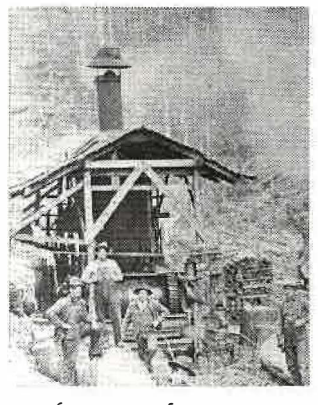
Bordeaux, WA logging camp, circa 1900.

Topical Index Bill Number to Session Law Table Session Law to Bill Number Table Gubernatorial Appointments Legislative Leadership Standing Committee Assignments